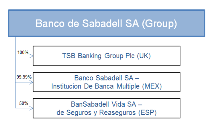
Chart 3: Main subsidiaries and investments of Sabadell

The main subsidiaries and investments of Sabadell can be found in the following chart: